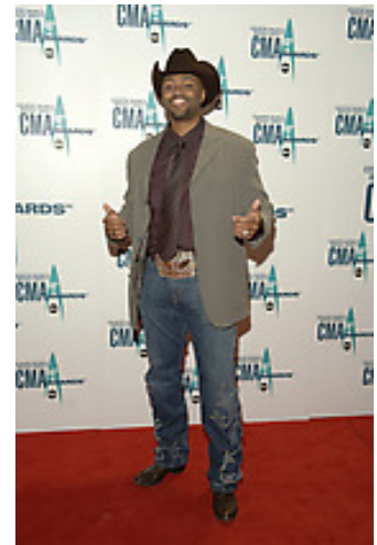
Cowboy Troy on the Red Carpet on Monday, Nov. 6 for "The 40th Annual CMA Awards" in Nashville.

When you're six feet, five inches tall you stand out. Add a cowboy hat and you stand out even more. Then, make the subject from Texas with darker than average skin and there's no question that Cowboy Troy (AKA Troy Coleman) isn't exactly an average guy. Yet while Troy may revel in being instantly identifiable from the rank and file in many ways, he also feels that his music shouldn't be deemed something outrageous, gimmicky, or bizarre. "I grew up listening to a mix of country music, rap and rock, with a little bit of funk and pop," Coleman says. "That didn't make me unusual back home (Dallas, Texas). Whenever I would go into the honky-tonks and they put on Run-DMC or Sir Mix-A-Lot, the floor would be packed with the cowboy hats swaying and people having a good time dancing. So it didn't seem like that big a deal for me once I decided to try music that all these things would converge in my music."